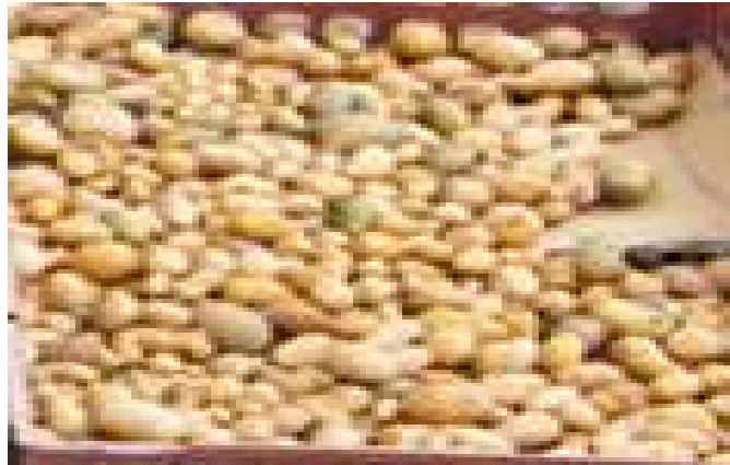
Fig. 2: Microtubers showing growth abnormalities long, cylindrical narrow shapes, smooth skinned and increasing the eyes