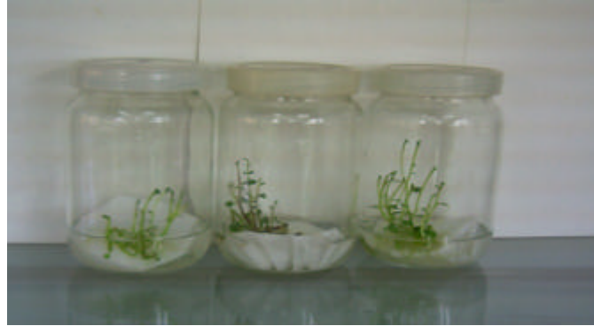
Fig. 1: Shoot growth developing from 5 subculture of meristem tip on M.S medium supplemented with jasmonic acid and coumarin